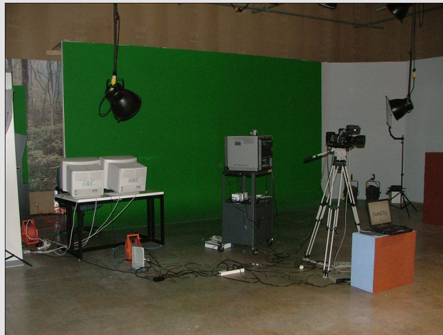
Behind the scenes during a video taping session.

GTN IS HAPPY TO PRESENT JIM CRADDOCK'S ORIGINAL PNEUMANETICS DVD